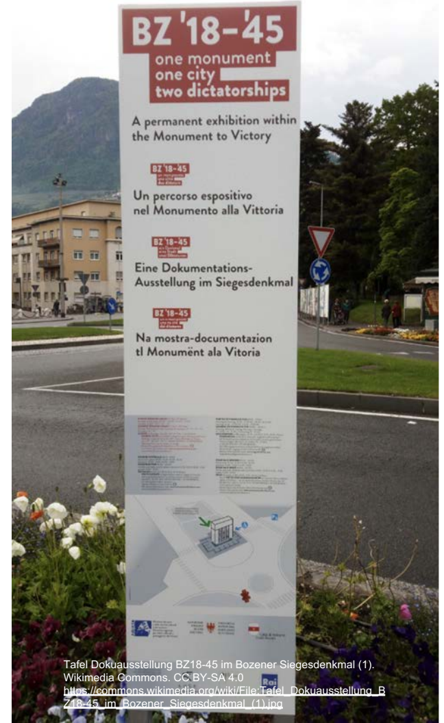
Tafel Dokuausstellung BZ18-45 im Bozener Siegesdenkmal (1).

https://www.cbc.ca/news/world/bolzano-italy-victory-monument-lessons-1.6632883