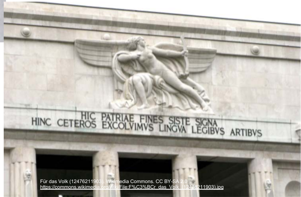
Für das Volk (12476211903).

What are the classic fascist symbolisms?